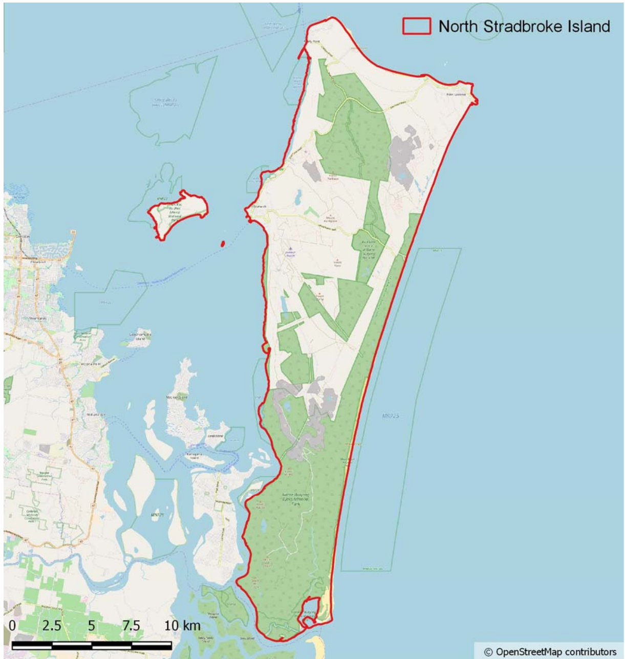
MAP 1. Minjerribah (North Stradbroke Island) (includes Peel Island).

Data presented in the tables below is at up to four geographical levels (from smallest to largest) as set out on the following pages: