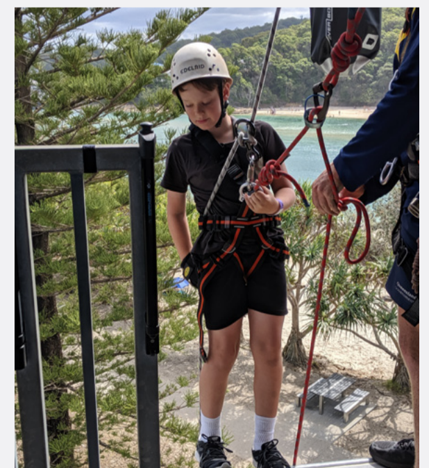
Abseiling at Gold Coast Recreation Precinct